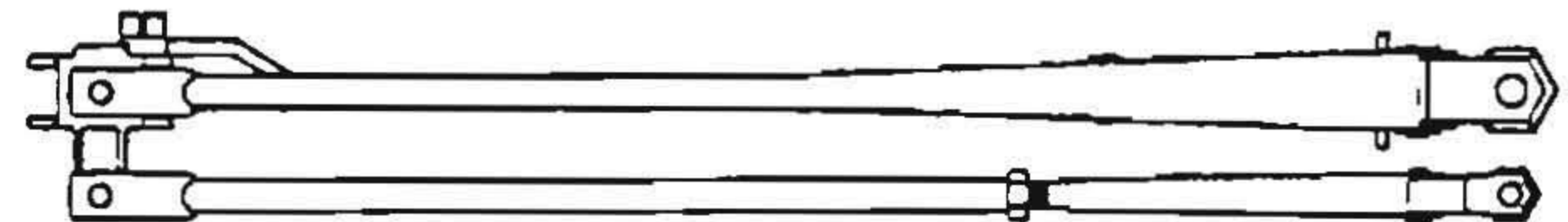
7000 SERIES PANTOGRAPH ARM W/ADJ.IDLER

AVAILABLE IN: 0 DEG. TO 15 DEG. DOWN BEND UP TO 28 IN. MAXIMUM LENGTH BLACK OR ANTI-GLARE FINISH SADDLE WIDTH: .605/.625 IN.