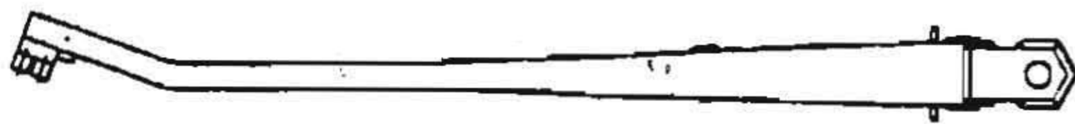
5000 SERIES (R.H.) ARC ARM

AVAILABLE IN: 0 DEG. TO 28 DEG. SIDE BEND UP TO 22.5 IN. MAXIMUM LENGTH BLACK OR ANTI-GLARE FINISH SADDLE WIDTH: .218 IN.