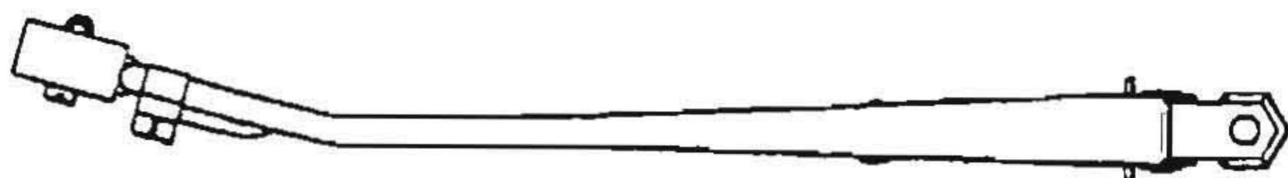
75000 SERIES (R.H.) PANTOGRAPH ARM

AVAILABLE IN: 0 DEG. TO 20 DEG. SIDE BEND 0 DEG. TO 15 DEG. DOWN BEND UP TO 28.75 IN. MAXIMUM LENGTH BLACK OR ANTI-GLARE FINISH SADDLE WIDTH: .605 IN.