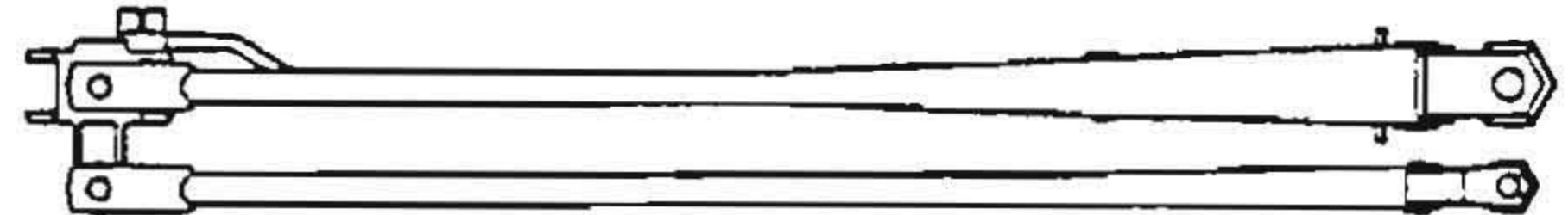
7500 SERIES PANTOGRAPH ARM

AVAILABLE IN: 0 DEG. TO 15 DEG. DOWN BEND UP TO 28 IN. MAXIMUM LENGTH BLACK OR ANTI-GLARE FINISH SADDLE WIDTH: .605/.625 IN.