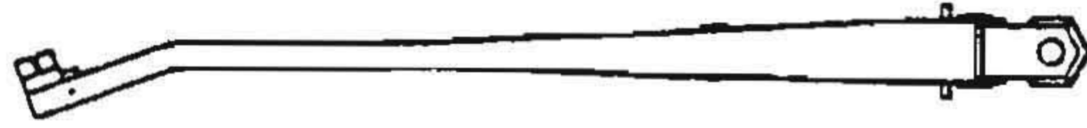
4000 SERIES (L.H.) ARC ARM

AVAILABLE IN: 0 DEG. TO 30 DEG. SIDE BEND UP TO 22.5 IN. MAXIMUM LENGTH BLACK OR ANTI-GLARE FINISH SADDLE WIDTH: .218 IN.