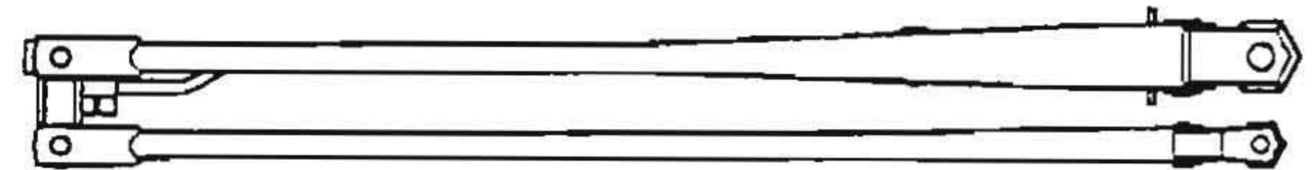
6500 SERIES: PANTOGRAPH ARM

AVAILABLE IN: 0 DEG. TO 15 DEG. DOWN BEND UP TO 28 IN. MAXIMUM LENGTH BLACK OR ANTI-GLARE FINISH SADDLE WIDTH: .218 IN.