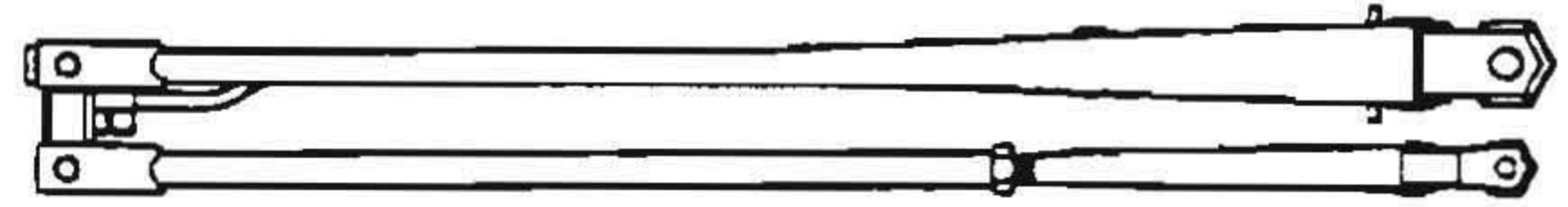
6000 SERIES PANTOGRAPH ARM W/ADJ.IDLER

AVAILABLE IN: 0 DEG. TO 12 DEG. DOWN BEND UP TO 28 IN. MAXIMUM LENGTH BLACK OR ANTI-GLARE FINISH SADDLE WIDTH: .218 IN.